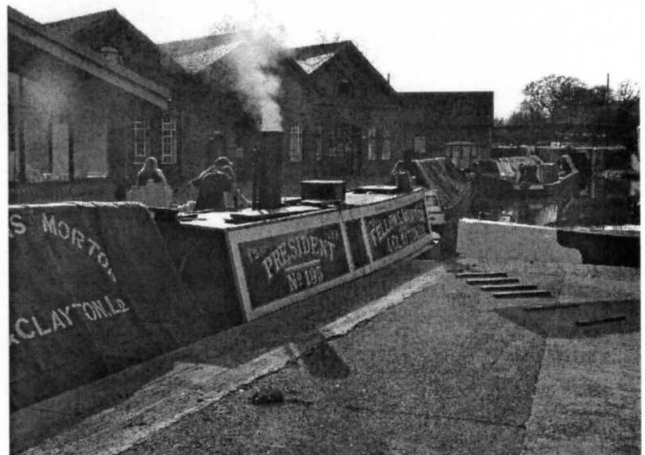
President at Hatton workshops

So, somewhat apprehensive we decided to "crew" for President, a 1909 Fellows, Morton & Clayton steam powered narrow boat, along with the butty, Kildare, built in 1913. Arriving at the Black Country Museum around half seven on the Friday evening we had a pleasant surprise, not only had the coal been loaded but both boats had been taken out of the museum & on to the canal, which would save us valuable time on the Saturday. This was to be the first leg of a trip that the boats were undertaking to London's Little Venice. We were taking the boats from the Black Country Museum to Hatton Workshops, which would take two full days.